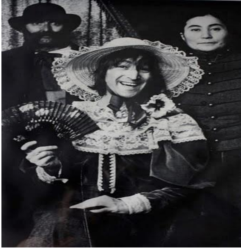
John Lennon – Here We Go Again (Lennon/Spector) – Menlove Avenue '86

A leftover track from the Rock 'n' Roll sessions with Phil Spector.